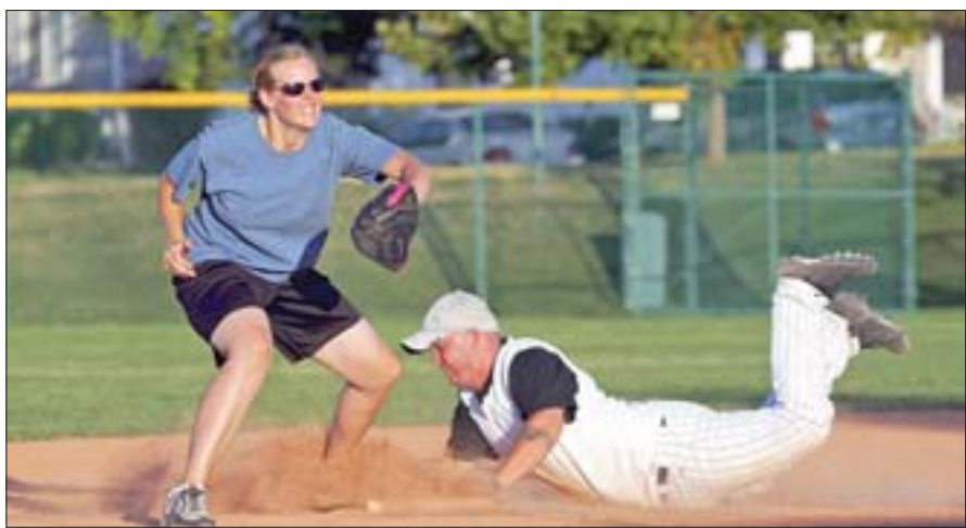
Consider joining a sports team in order to meet people who can help you get ahead.

"Get involved with a group of diverse professionals and showcase what makes you valuable," Berrios said. "Find groups aligned with your goals." If membership is too expensive, she suggested looking out for free webinars and classes.